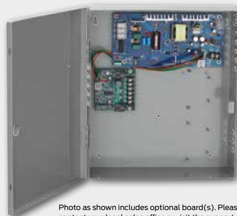
Photo as shown includes optional board(s). Please contact your local sales office or visit the support section on our website for configuration assistance.